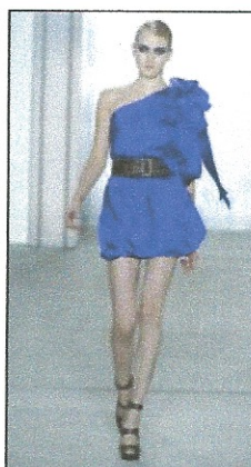
Alice Temperley's designs

I've only ever had one – all the steam and fiddling made me go slightly bananas.